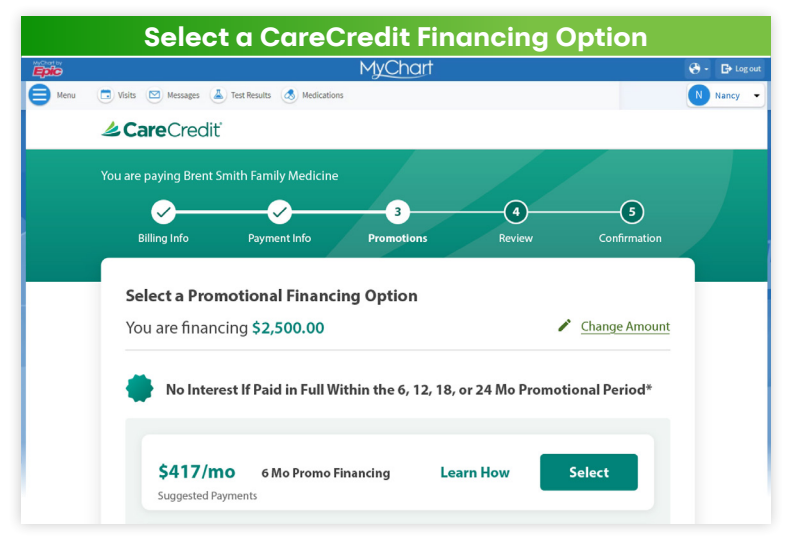
Cardholders can access a convenient financing option that helps fit their budget.

The CareCredit Patient Financing app makes it easy for providers who accept CareCredit to offer flexible financing options directly within MyChart and the Hyperspace resolute workflow .